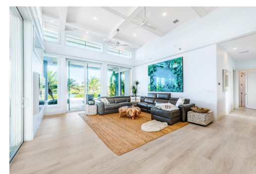
Nestled along the picturesque canals of Freeport/Lucaya in Grand Bahama Island, this exquisite 4...

Nestled along the picturesque canals of Freeport/Lucaya in Grand Bahama Island, this exquisite 4 bedroom, 4.5 bath home epitomizes waterfront luxury living. Boasting an expansive 4500 square feet of living space, every inch of this residence is designed to inspire awe and relaxation.