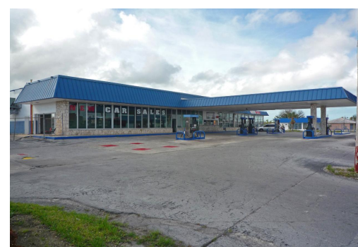
This opportunity to purchase Freeport Jetwash and Automart provides potential investors a unique...

This opportunity to purchase Freeport Jetwash and Automart provides potential investors a unique turnkey opportunity for this well established business. Included in the sale price is: all Buildings, Equipment, two parcels of developed land totaling 3.64 acres in Downtown Freeport and the Freeport Jetwash business of vehicle sales, automotive part sales, automotive servicing and two service stations. Also included is: all inventory, accounts receivables, Grand Bahama Port Authority License, etc. Kindly contact our office for further information and details....read more on our website.