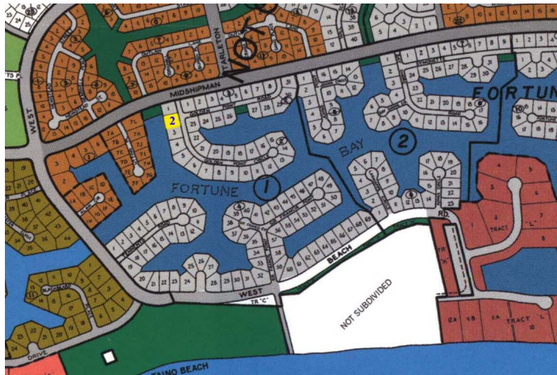
FORTUNE BAY UNIT 1, 2 & 3