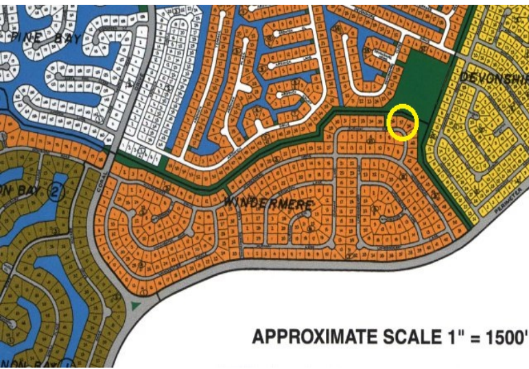
APPROXIMATE SCALE 1" = 1500'