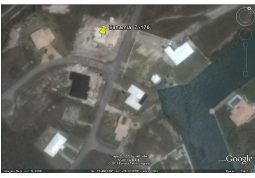
This lot is fully serviced, flat and rectangular shaped.

The lot is bounded on the north by lot #175 121.99' x on the west by lot #177 117.39' on the east by Andrews Drive for 110' and fronting on the south by Penny Lane.