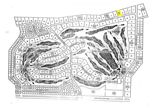
Large Lot! Affordable Price!

Located on Cadwallader Jones Drive Court in North Bahamia, this lot is located in close proximity to down town Freeport, the airport, the harbor, shipyard and Vopac. Measured a little under an acre this lot has utilities in place this lot and is ideal for building a small rental property or vacation rentals for golfers. The beach at Xanadu is minutes away....read more on our website.