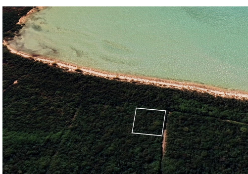
Located just minutes from the beach in Bahama Island Beach, these lots with a spacious 20,000...

Located just minutes from the beach in Bahama Island Beach, these lots with a spacious 20,000 square feet are a great opportunity to own property in The Exumas! The beauty of the beaches of The Exumas speak for themselves and with an array of thrilling sports and activities waiting for exploration, including snorkeling, diving and boating the adventure possibilities are endless. Perfect for off-grid living and investing, these two lots offer an affordable opportunity to own property in this renowned paradise....read more on our website.