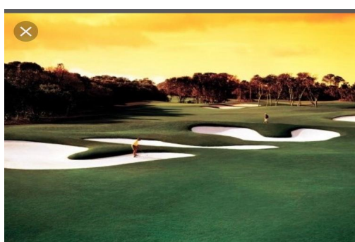
Grand Bahama Coral Road 10,961 square feet lot is really on sale! This beautiful lot is within...

Grand Bahama Coral Road 10,961 square feet lot is really on sale! This beautiful lot is within walking distance of the beach. It is very close to Lucaya Marketplace with many restaurants and shops. The price is negotiable....read more on our website.