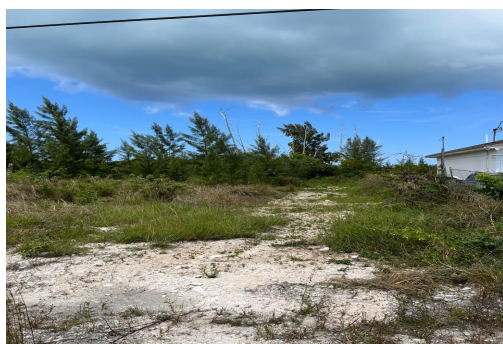
A great area to build that first family home. A quiet environment having access to main roads that...

A great area to build that first family home. A quiet environment having access to main roads that connect to other major roads. It is within walking distance to the food store, bank, a popular school, numerous eateries and other wonderful and convenient amenities. All utility infrustructure, paved asphalt roads and drainage are installed to the area. Don't miss this opportunity to create your dream home....read more on our website.