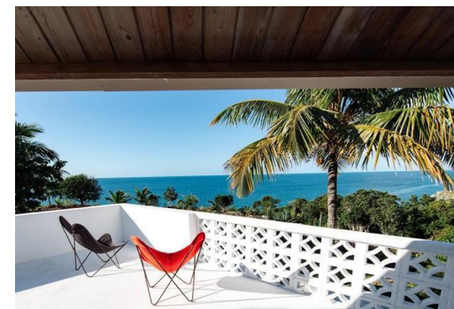
Single Family Home in Eleuthera

Nestled in Gregory Town, the Artist's Colony overlooks Pitmann's Cove, surrounded by lush gardens and mature trees. The estate features a main building with four spacious bedrooms, each boasting its own bathroom, closet, sitting area, and patio with sea views. Recently renovated with high-quality materials, including a metal alloy roof and restored wood floors, the property offers a newly built chef's kitchen with premium appliances and garden views. Additionally, there's a pentagonal Artist's Work Room with an ensuite bathroom, perfect for creative pursuits. The living room, housed in a star-shaped structure near the sea, offers a terrace with ample shade from a nearby banyan tree. Originally designed by renowned architect Ray Nathaniels in the 1960s, the Artist's Colony has hosted notabl...read more on our website.