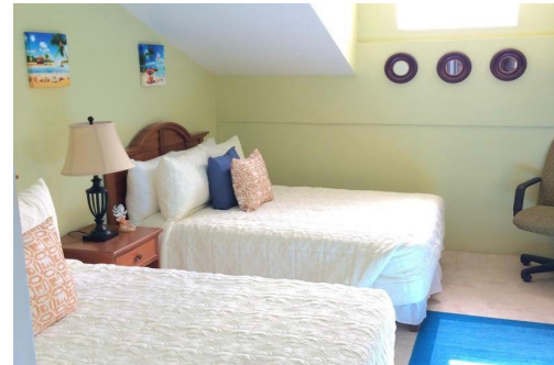
Condo in New Providence/Paradise Island

This wonderful 1,059 sq ft townhouse on St. Alban's Drive is a great find. The property is well-maintained and gated for your peace of mind. The 3-storey furnished unit comprises two bedrooms and two and a half bathrooms. Features include a front porch and balcony, ductless A/C, ceiling fans and tile flooring throughout. The complex offers assigned parking and a shared pool. Kids are allowed, but no pets. St. Alban's Drive is conveniently located near to the Fish Fry/ Arawak Cay, for those who enjoy dining out. Downtown Nassau, Junkanoo Beach, and Saunder's Beach are also nearby. While Baha Mar is only a 10-minute drive. A great location to live and commute. Call to schedule your appointment today....read more on our website.