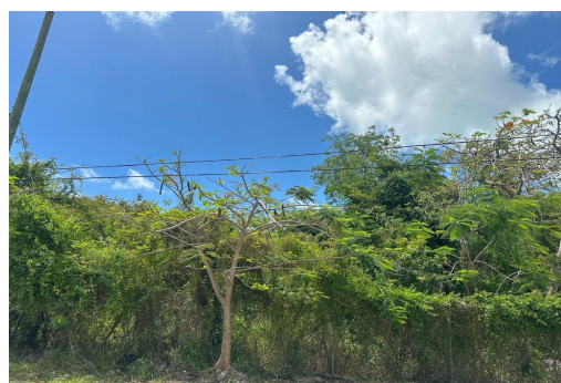
Lots/Acreage in New Providence/Paradise Island

Captivating, Impeccable, Beautiful, Safe & Peaceful 2-acre multi-family lot at an incredible price in Seabreeze Estates. This area is the western part of Seabreeze Estates called Imperial Park and it is an awesome upscale neighborhood. It is next to churches, schools, parks, medical centers, plant nurseries, food stores, restaurants, pharmacies, shopping centers and the sea is just 2 minutes away! This multifamily 2-acre lot will be gone in a heartbeat. Hurry before it is too late....read more on our website.