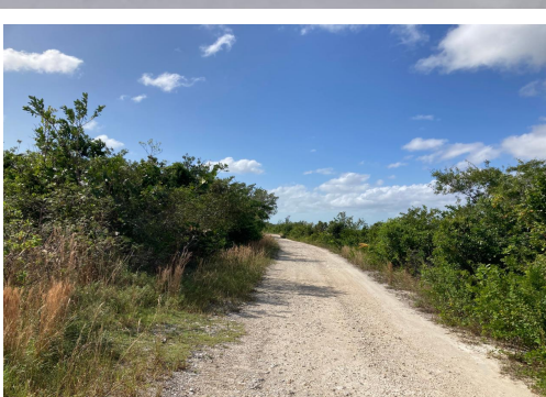
This 2 acreage is the perfect spot for a commercial homes spaces. With ocean views, it is certainly...

This 2 acreage is the perfect spot for a commercial homes spaces. With ocean views, it is certainly price to sell! It has an elevation of 14 feet and the overview of the creek is a sight to see. For bonefishing lovers, South Andros is one of the top islands in the Bahamas that is known for have a marvelous fishing season every year. This lot sunset views are simply breathtaking and the island life is truly tranquil. Contact us today for more info....read more on our website.