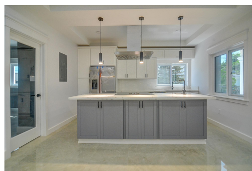
This beautifully maintained 3 bedroom, 3 bathroom townhome in the quiet Kiskadee Drive community,...

This beautifully maintained 3 bedroom, 3 bathroom townhome in the quiet Kiskadee Drive community, New Providence, is now available for long-term rental. Located just minutes from the airport, this home combines convenience with island charm. The open and airy floor plan includes three generously sized bedrooms, each with its own bathroom, offering privacy and comfort. The living spaces are bright and welcoming, while the modern kitchen provides all the essentials for easy living. Residents also have access to a shared pool, perfect for relaxing and enjoying the Bahamian sunshine. This townhome's prime location near the airport, local shops, and Nassau's beautiful beaches makes it an ideal choice for those seeking a comfortable and convenient long-term rental....read more on our website.