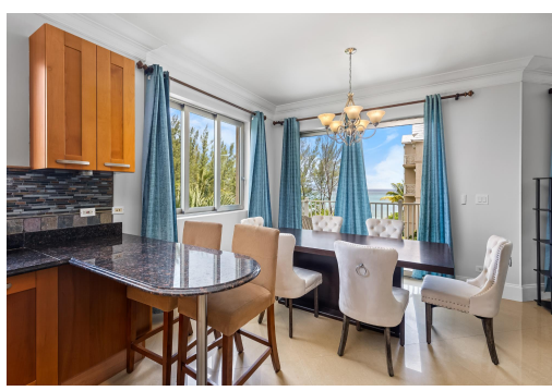
The Love Beach Walk Building 4, Unit #2 has been recently renovated with a modern look that...

The Love Beach Walk Building 4, Unit #2 has been recently renovated with a modern look that showcases its spacious and open layout. This elevated condo features 1,425 square feet of natural light and offers breathtaking views of Love Beach. It comes with brand new appliances, including a stackable washer and dryer, and has two balconies overlooking the ocean and pool. One of the balconies is a large wrap-around that connects the dining room to the master bedroom, along with a two-car parking space. The apartment also comes with standby generator and 24 hour gated security. The area also has access to resorts, great restaurants, schools and convenient shopping, all just a short distance from the International Airport....read more on our website.