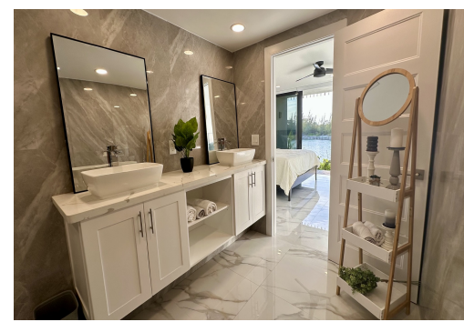
Long-term rental now available at King's Bay Condominiums. This fully renovated 2-bedroom,...

Long-term rental now available at King's Bay Condominiums. This fully renovated 2-bedroom, 2-bathroom apartment in Freeport, Grand Bahama offers modern comfort with panoramic canal views, hurricane-impact windows and doors, and energy-efficient features including central air and a tank less water heater. Enjoy spacious living with walk-in closets, a full-size washer and dryer and dedicated parking in a secure, gated community with a swimming pool. Offered at $2,300 per month with a one-year lease.