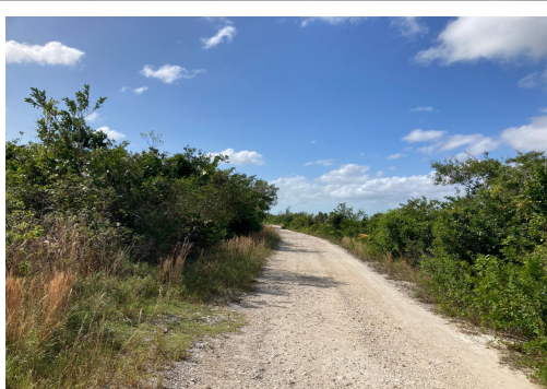
This 3.8 acreage is the perfect spot for a commercial homes spaces. With ocean views, it is...

This 3.8 acreage is the perfect spot for a commercial homes spaces. With ocean views, it is certainly price to sell! It has an elevation of 14 feet and the overview of the creek is a sight to see. For bonefishing lovers, South Andros is one of the top islands in the Bahamas that is known for have a marvelous fishing season every year. This lot sunset views are simply breathtaking and the island life is truly tranquil. Contact us today for more info...read more on our website.