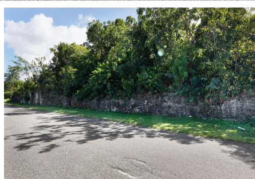
Discover the perfect opportunity to build your dream home in Serenity, a sought-after gated...

Discover the perfect opportunity to build your dream home in Serenity, a sought-after gated community in western New Providence. This spacious 6000 sq ft lot, located on Lot 4 Block 44, offers an excellent foundation for a comfortable family home or investment property. Serenity is known for its peaceful environment, secure surroundings, and modern amenities, making it ideal for families and individuals seeking tranquility and convenience. Residents enjoy 24-hour security, a community park, and close proximity to schools, shopping, and beaches. Don't miss the chance to own a piece of this premier neighborhood. Contact us today to make this lot yours!...read more on our website.