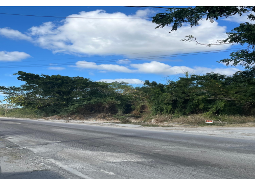
Presenting Lot #6A Golden Isles, Cowpen Road, Nassau, New Providence, Bahamas – a prime...

Presenting Lot #6A Golden Isles, Cowpen Road, Nassau, New Providence, Bahamas – a prime opportunity for discerning buyers. This multi-family vacant land spans 6,505.5 square feet, offering ample space for your vision. Nestled amidst both residential and commercial properties, this lot provides a strategic location with potential for future growth and development. Ideal for those looking to build a custom home in a well-situated area, this property is now available for sale. Contact us for more information and to schedule a viewing....read more on our website.