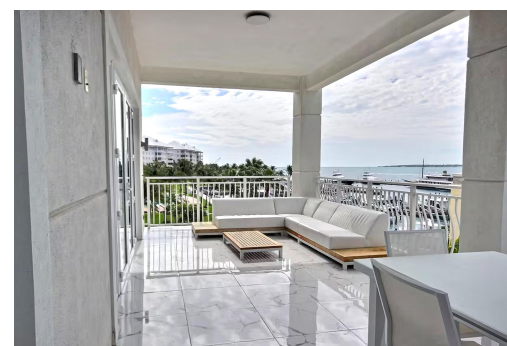
Welcome to Unit 104 at One Ocean, a luxurious waterfront residence on Paradise Island. This...

Welcome to Unit 104 at One Ocean, a luxurious waterfront residence on Paradise Island. This three-bedroom plus den, three-and-a-half-bathroom condo features an open-concept layout, high-end finishes, and floor-to-ceiling windows. Two expansive balconies offer breathtaking views of Montagu Bay, the Atlantic Ocean, and the Ocean Club Golf Course. The gourmet kitchen boasts premium appliances, sleek countertops, and custom cabinetry. The primary suite includes a spa-like en-suite and terrace access. Exclusive features include direct elevator access, two underground parking spaces, a private 7x14 storage unit, direct pool access, a private dock with a 50-foot slip and 25,000-pound boat lift, and golf-cart-friendly parking. One Ocean offers resort-style amenities, including a private marina, wa...read more on our website.