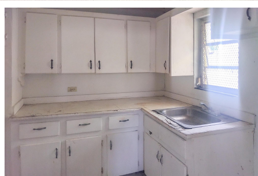
This residential fixer upper is in the heart of New Providence, Nassau, Bahamas. It has amenities...

This residential fixer upper is in the heart of New Providence, Nassau, Bahamas. It has amenities too numerous to mention all. However, essential for your family would be school, park, shops of all kinds. This 3 bedroom, 1 bathroom house can be transformed into a welcoming home for a family. There is also a very large backyard for recreation....read more on our website.