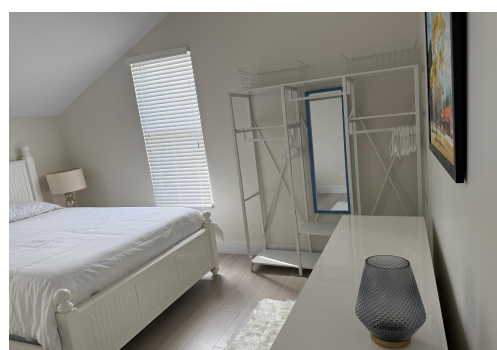
Nestled in the prestigious gated community of Balmoral, this stunning 3-bedroom, 2.5-bathroom condo...

Nestled in the prestigious gated community of Balmoral, this stunning 3-bedroom, 2.5-bathroom condo offers the perfect blend of modern luxury and island charm. Designed with style and comfort in mind, the spacious open-concept living area is bright and inviting, seamlessly connecting to a sleek, fully equipped kitchen. The primary bedroom features an ensuite bathroom, while the two additional bedrooms share a beautifully designed full bath. Every detail of this home is brand new, from the high-end finishes to the contemporary furnishings. Step onto the private balcony and take in breathtaking views of the ocean, Baha Mar, and Goldwynn, all from the comfort of your outdoor lounge area. Located in Balmoral, a secure and exclusive residential community, this condo provides a tranquil retreat ...read more on our website.