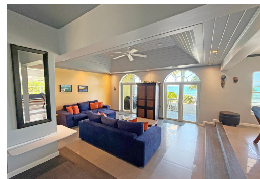
Harbour Lights is an active STR property in the popular gated community of February Point....

Harbour Lights is an active STR property in the popular gated community of February Point. Centrally located just outside of George Town, the property offers convenience of location and lovely views into famous Elizabeth Harbour. Approximately 15 minutes from GGT airport, easily enjoy your home within an hour of arrival onto island. Amenities included are a full service restaurant, 2 swimming pools, hot tub, full service spa and recreational options for tennis and a well-equipped gym facility. The marina on site makes it easy to launch a daily boat trip. Golf cart is a favourable mode of transport around the community....read more on our website.