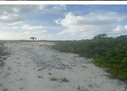
This residential lot is located on the beautiful island of San Salvador, Columbus Landing Four...

This residential lot is located on the beautiful island of San Salvador, Columbus Landing Four subdivision in Sandy Point. Sandy Point is about 25 minutes from the International Airport and about 20 minutes South of Cockburn Town. Bahamas Air has daily flights from Nassau to San Salvador and one weekly flight on Saturday from Miami to San Salvador. There are two weekly mailbox services from Nassau and one bi-weekly service from Fort Lauderdale. There's Bank Of The Bahamas on the island. Lot#5 has access to all utilities and is a 2-3 minute drive to Grotto Beach. There are 3 hotels and Air B&Bs on the island. Rental cars and motor scooters are available at the airport. San Salvador is a great place to have a home away from home, and this lot would be ideal for that....read more on our website.