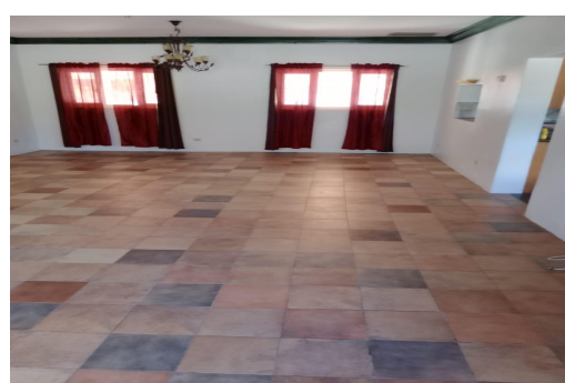
Move in today to this spacious and semi-furnished single-family home in the welcoming community of...

Move in today to this spacious and semi-furnished single-family home in the welcoming community of Yamacraw Beach Estates. This 3-bedroom, 2-bathroom property features a modern kitchen with sleek granite countertops, a stove, and a refrigerator, complemented by ceramic tiles throughout. Enjoy the convenience of an organized laundry room equipped with a stackable washer and dryer, perfectly located next to the kitchen. The open and airy living room flows seamlessly into the dining area, creating an ideal space for family gatherings and entertaining. The master suite boasts a walk-in closet and a generously sized en-suite bathroom. Situated near grocery stores, schools, churches, and with easy access to major highways, this home offers both comfort and convenience. Don't miss the opportuni...read more on our website.