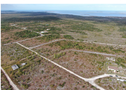
This vacant single-family lot, located in Section 2, Block F of Holmes Rock, presents an excellent...

This vacant single-family lot, located in Section 2, Block F of Holmes Rock, presents an excellent opportunity for prospective homeowners or investors. Situated in a rapidly developing area with new construction on the rise, this property is competitively priced and ready for immediate purchase. Don't miss your chance to secure a prime parcel in this up-and-coming neighborhood. Make this lot the foundation for your future home today....read more on our website.