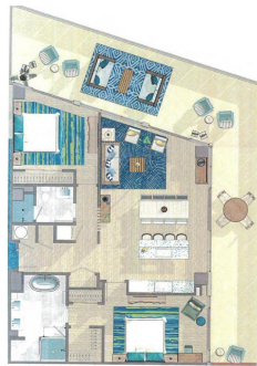
2-BEDROOM (B2) UNIT For those that think The Pointe is the best! The Four B2 plans are out front and have the best views of the harbor, Marina, pool, beach and the cruise ship docks in the distance. Most of the time, Paradise Island is in plain view! There is plenty of space for owners and guests to enjoy over 1,350 square feet.