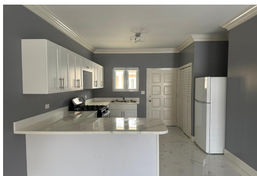
Beautiful newly built 2 bedroom, 1 bathroom unit comes fully equipped with all appliances. Unique...

Beautiful newly built 2 bedroom, 1 bathroom unit comes fully equipped with all appliances. Unique bathroom includes both stand up shower and tub for dual use. Brand new appliances and split units in each room. Modern security door lock, surveillance cameras and generator....read more on our website.