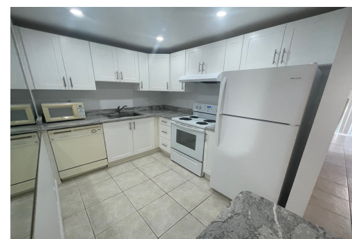
Centrally located on a beautiful beach and near the hub of all activities called Port Lucaya, this...

Centrally located on a beautiful beach and near the hub of all activities called Port Lucaya, this one bedroom condo on the first floor with direct access to outdoors from your own unit is tastefully appointed and is only 10 minutes from Freeport International airport and in walking distance to Shops and Restaurants! There is a wonderful poolside bar and restaurant, a salon on the premises, and the nearest grocery store just minutes away. The condominium has new slip AC, new appliances. Maintenance fee is $257/m including hurricane insurance, but there is a temporary reserve fund assessment totaling $659 monthly. Drop an anchor on the island by purchasing this unit and choose activities from kayaking, boating or swimming with dolphins, bicycling, renting Jet Skis, ...read more on our website.