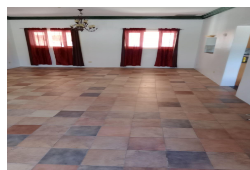
Available for immediate occupancy, a large, spacious and elegant Semi furnished 3 bed 2 bath...

Available for immediate occupancy, a large, spacious and elegant Semi furnished 3 bed 2 bath stand-alone home in the family friendly community of Yamacraw Beach Estates. The kitchen has granite countertops, and beautiful ceramic tiles. The kitchen is outfitted with a stove and refrigerator and has beautiful granite countertops, and ceramic tiles. There is an organized laundry room adjacent to the kitchen with a stackable washer and Dryer. The living room is spacious and connects with the dining room. The master bedroom has a his and walk in closet and a large master bath. This is the perfect home for family gatherings and entertaining. The property is ideally situated near grocery stores, schools, churches, and easily accessible to major highways. Make this home your own today....read more on our website.