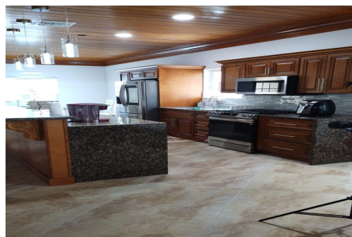
Welcome to this stunning newly renovated tri-level duplex townhouse, perfect for those seeking...

Welcome to this stunning newly renovated tri-level duplex townhouse, perfect for those seeking luxury space and modern living. Each unit in this property offers 3 spacious bedrooms and 3.5 bathrooms ensuring comfort and privacy for every member of the household. As you enter, you will be greeted by a bright and airy open concept ground floor, seamlessly blending the living, dining, and kitchen areas. Custom cabinetry and high-end stainless steel smart appliances make the kitchen ideal for everyday meals and entertaining. On the 2nd floor you will find 2 bedrooms, 2 bathrooms and the laundry room. The master suite is particularly impressive taking up the entire 3rd floor. It features a TV room, an office, 2 large closets and a luxurious bathroom with a jetted tub, stand-alone shower and his...read more on our website.