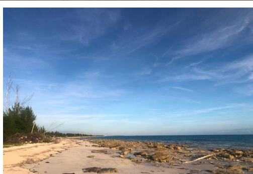
This untouched property is the perfect place to build a beach home or eco-resort. This listing...

This untouched property is the perfect place to build a beach home or eco-resort. This listing consist of two vacant lots across from each other. One lot is an interior, 32,029 sq. ft. The beach front lot is 14,451 sq. ft. with 140 ft on the water. Bassett Cove is in the eastern area of Grand Bahama between Beaven's Town and Gambier Point. Utilities are close to the lots. Give us a call to arrange a viewing....read more on our website.