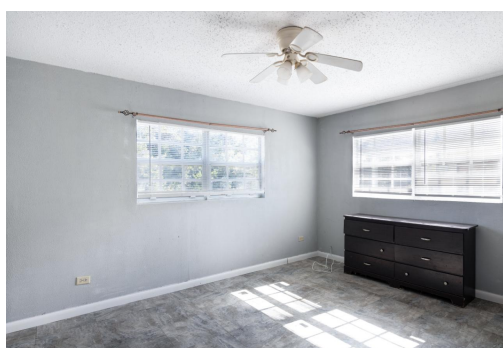
Escape to the Big Yard with this opportunity to own a 1.42-acre tract nestled in Andros Beach...

Escape to the Big Yard with this opportunity to own a 1.42-acre tract nestled in Andros Beach Colony! Located just 3 minutes away from the beach, this property boasts not just one, but TWO charming 2 bedroom 1 bathroom cottages, with a little elbow grease they would be perfect for a serene getaway or lucrative rental income. Key Features: Two Cozy Cottages: Each cottage offers the ideal blend of comfort and tranquility, providing the perfect retreat for you and your guests. Ample Space: With 1.4 acres of lush land, there's plenty of room to build your dream island oasis. Let your imagination run wild and create the ultimate tropical haven. Utilities in Place: Enjoy the convenience of utilities already in place, ensuring a seamless transition to your new island retreat. Andros is reno...read more on our website.