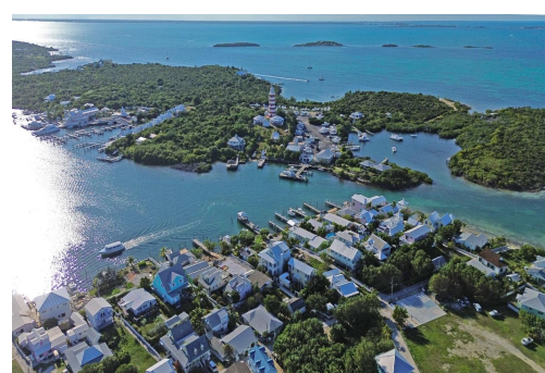
Welcome to your chance to own a piece of paradise in Hope Town! Nestled in the heart of this...

Welcome to your chance to own a piece of paradise in Hope Town! Nestled in the heart of this charming Bahamian island, this oversized 4,871 square foot town lot presents an exceptional opportunity for those seeking the perfect location. Situated just a stone's throw away from the stunning Atlantic Beach, this property boasts unparalleled proximity to the crystal-clear waters and powdery white sands that define the beauty of the region. With a mere one-minute walk to both the breathtaking beachfront and the convenient Lower Public Dock, embracing the tranquil island lifestyle has never been more accessible. Formerly the site of a thriving rental house with amazing views of the iconic lighthouse from the second floor deck, this lot presents an incredible income potential for those looking to ...read more on our website.