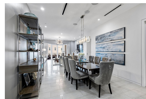
Indulge in luxurious island living with this modern 3 bedroom, 3.5 bathroom condo, offering...

Indulge in luxurious island living with this modern 3 bedroom, 3.5 bathroom condo, offering breathtaking views of Nassau Harbour and the Marina. The 03 stack features an expansive open kitchen, a covered balcony, and stunning stonework throughout. Inside, the tropical-inspired décor meets sleek, contemporary design. Enjoy high-end finishes like 8' solid-core German doors and custom Italian cabinetry paired with Wolf, Bosch, and Sub-Zero appliances. Added developer upgrades include upgraded backsplash and bathroom tiles, a built-in coffee bar, a surround sound entertainment system, and Savant controls. One Ocean provides 24-hour security, underground parking, private elevator access, a pool deck, and concierge services. The property is being sold furnished....read more on our website.