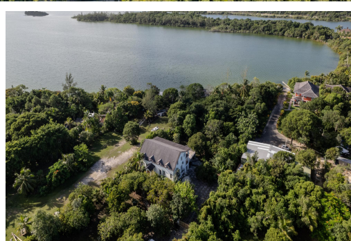
Seize this exceptional opportunity to own nearly 2.5 acres of stunning lakefront property, where...

Seize this exceptional opportunity to own nearly 2.5 acres of stunning lakefront property, where the beauty of nature unfolds right at your doorstep. The residence features over 4,200 square feet of living space, complemented by an unfinished basement and a two-car garage. Upon entering, you are greeted by an open foyer that flows seamlessly into the living, dining, and family areas. The kitchen, designed with an open layout, offers a picturesque view of the expansive pool deck. Each generously sized bedroom comes with its own en suite, while the master suite boasts a luxurious walk-in closet. The true allure of this property lies in its prime location atop Oakhill, providing breathtaking panoramic views of Lake Cunningham. Lush landscaping is adorned with a variety of fruit trees and vibr...read more on our website.