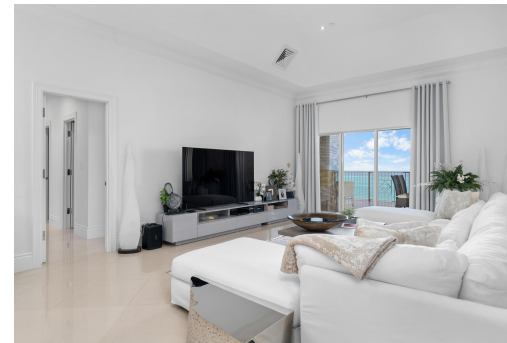
Offering breathtaking ocean views and the convenience of resort-style living in a secure setting,...

Offering breathtaking ocean views and the convenience of resort-style living in a secure setting, this 4-bedroom, 6.5-bathroom penthouse features 4,594 sq. ft. of luxury living space. Designed for modern living and entertaining, the elegant home features a grand mastersuite with his and hers bathrooms; a junior mastersuite for guests; two additional guest bedrooms with en-suite bathrooms; two expansive balconies; 12ft-high tray ceilings; an impressive Great Room open to the kitchen, and a separate family room. Both the main kitchen and outdoor kitchen feature professional grade stainless steel appliances housed in solid wood cabinetry. All bathrooms are elegantly finished with marble surfaces, Kohler appliances and floor-to-ceiling wall tile. Electric hurricane shutters with manual overrid...read more on our website.