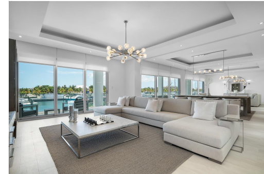
Spanning an impressive 3,614 interior SF and 596 exterior SF, this residence epitomizes spacious,...

Spanning an impressive 3,614 interior SF and 596 exterior SF, this residence epitomizes spacious, open-plan living, designed with a harmonious blend of contemporary opulence and natural elegance. The interiors exude effortless sophistication, seamlessly transitioning to expansive exterior spaces that invite you to savor the panoramic vistas of both the marina and the oceanfront. Each room is a testament to luxurious living, offering serene and picturesque views that redefine waterfront living. This magnificent home is a culinary haven, designed for both the avid chef and the casual entertainer. Outfitted with top-of-the-line appliances, including a Liebherr fridge and freezer, Bosch ovens and warming drawer, and a Miele dishwasher, this kitchen combines functionality with exquisite style. ...read more on our website.