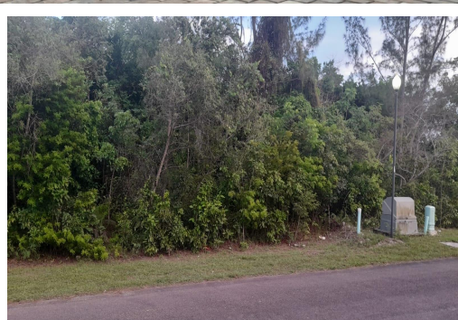
This is the ideal time to invest in the west! Serenity Subdivision is a secure, gated,...

This is the ideal time to invest in the west! Serenity Subdivision is a secure, gated, family-friendly community located minutes away from the international airport, shopping, and the upscale Albany, Old Fort Bay, Lyford Cay communities. Notable amenities include a clubhouse, pool, playground, and 24-hour security....read more on our website.