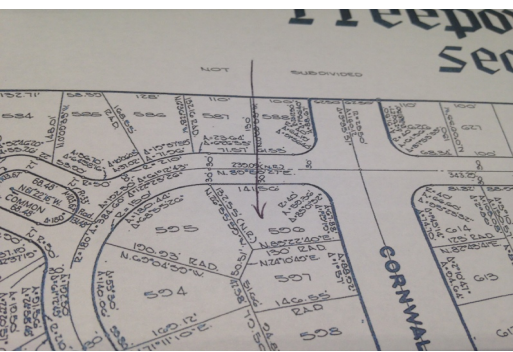
Unusually large lot for the subdivision and best priced, too!

Affordable Vacant Land available in the under developed Freeport Ridge Estates Subdivision.